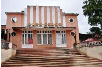
Art deco in Seles