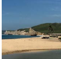
Beaches at Porto Amboim