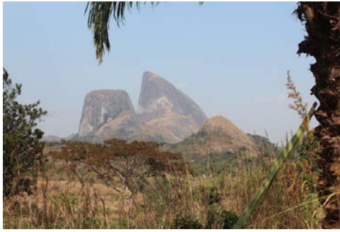
Kumbira Escarpment views