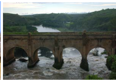
Rio Keve – the old bridge