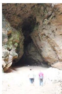
Sassa Caves and views