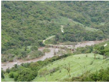
Views of Queve

After breakfast, we will visit the farm briefly, and then, we will head south along the Kumbira escarpment to Conda where we will pass by the Tocota thermal springs. We will then stop at the “Cachoeiras do Binga” waterfalls where we will have a quick picnic lunch (or alternatively, depending on time - perhaps we continue on to at the old fishing port of Porto Amboim to take lunch on the sea front). We aim to be back in Luanda mid evening 19:00 – 20:00.