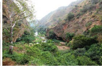
En route Sassa