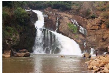
Cachoeiras / Binga Falls