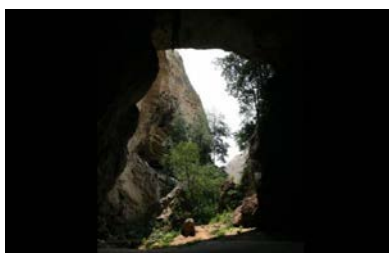
Sassa Caves and views