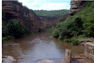
Rio Cubal Canyon Kikombo