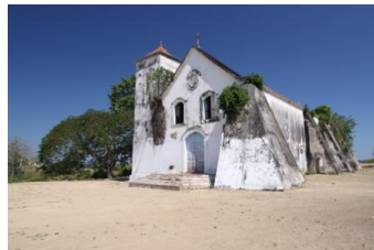
Church "Our Lady Victoria"