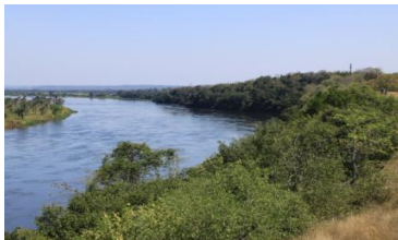
Kwanza River at Massangano