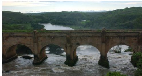
Bridge over River Queve above falls

Meals included Breakfast and Snack Lunch