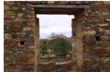
Ruins at Massangano