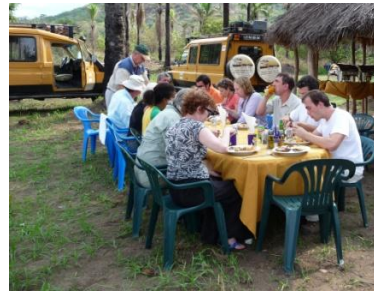
Enjoying the picnic