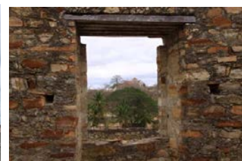
Ruins at Massangano