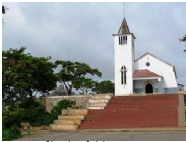
Church at Calulo

After breakfast we have some free time, then a “town tour” of Calulo and then start our journey back to Luanda through the rolling hills and mountains of Kwanza Sul via Cambambe Dam (the oldest dam on the River Kwanza) dating back to the late 50’s and still working with the original Swiss manufactured turbines. Here we will have a snack lunch and if we can obtain permission we will visit the dam wall. Here we will have a snack lunch before returning to Luanda via Dondo.