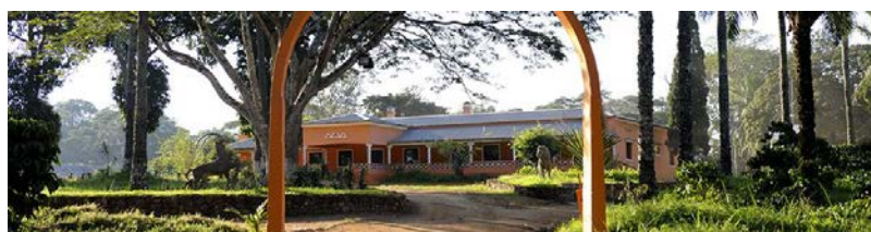
Main Farmhouse and reception at Cabuta