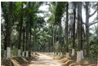
Cabuta farm Entrance (“Palm Avenue”)