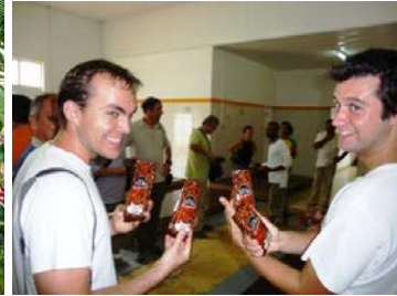
On the guided coffee tour