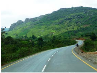
En route – spectacular Kwanza Sul scenery