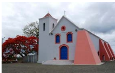
Church “Our Lady Victoria” rejuvenated!