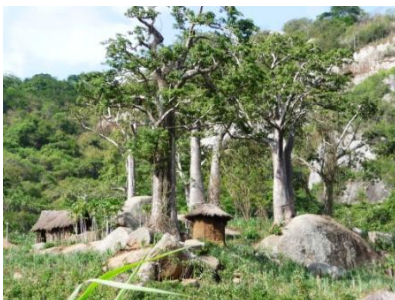
Pretty village en route to the