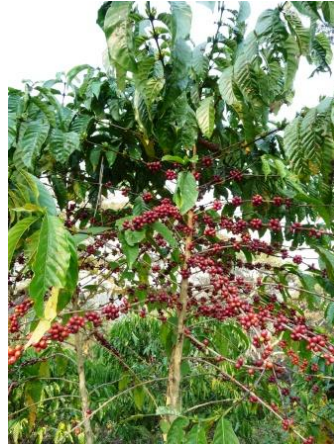
Mmm those red beans we all love so much !