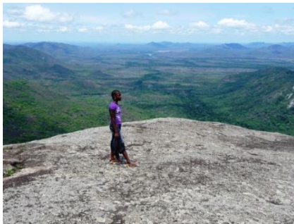
India (guide) atop Balloon Rock