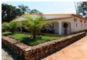
Restaurant at Cabuta