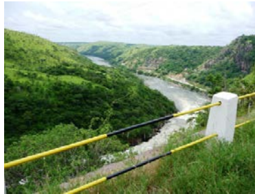
Views from Cambambe Dam