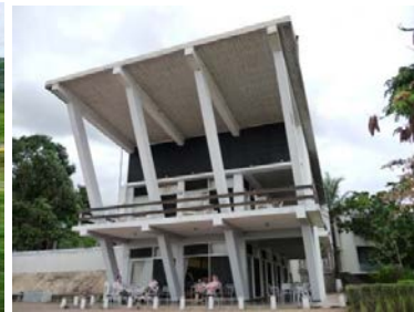
Interesting 50’s architecture at the old Pousada

Meals included Breakfast and Snack Lunch