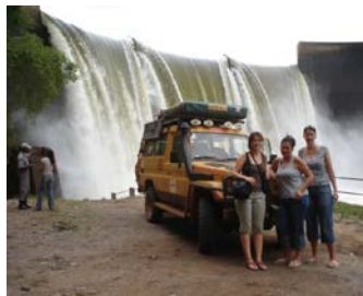
Cambambe Dam Wall