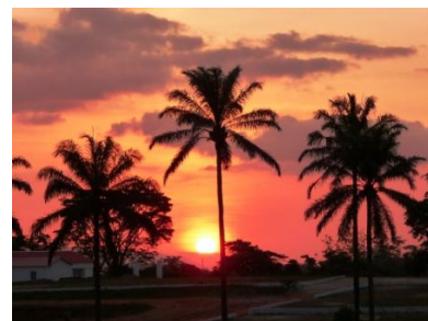
Sunset at the farm