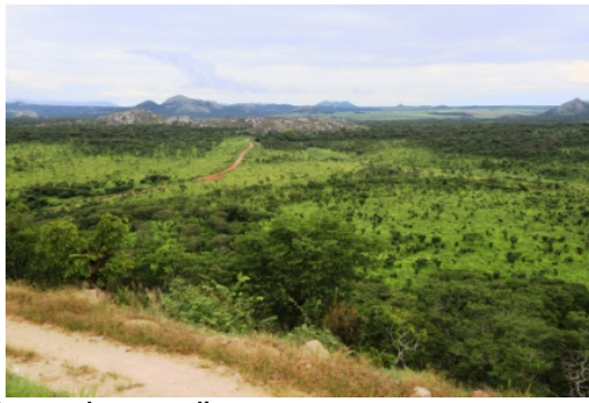
Views of Xixila Wine Farm and surroundings