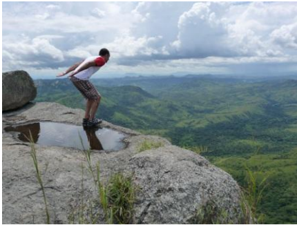
Don't do it ! Being seduced by the amazing 300° views from the Coffee farm

Meals included – Breakfast, Picnic Lunch and Dinner.