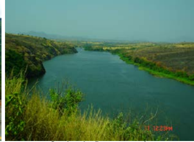
Cambambe Dam reservoir