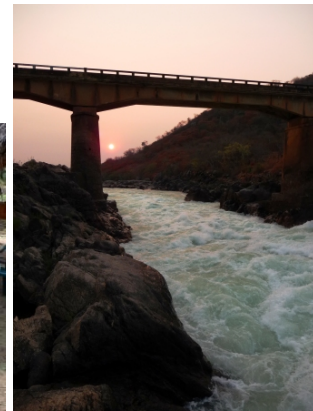
Sunset at Filomena de Camara Bridge