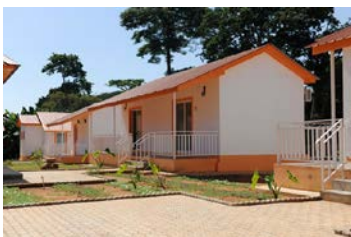
Comfortable air conditioned new bungalows