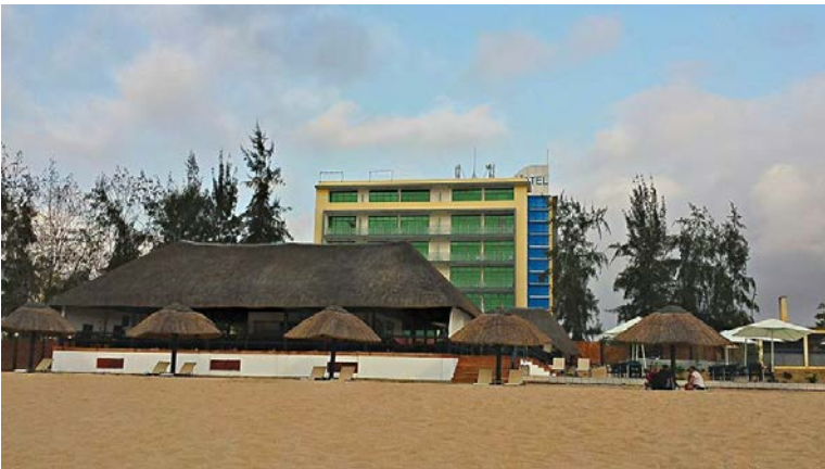
"RESTINGA HOTEL AND JANGO"