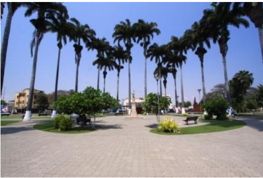
The Main Square "Administração" BENGUELA