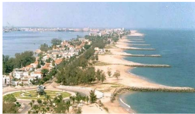
"The Restinga Lobito -