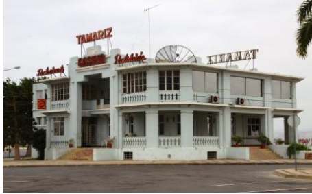
Art deco in Lobito – Restaurante Tamariz

After breakfast, we will spend a little time at the farm and then continue our trip south to Lobito. Upon arrival we will have a tour around the famous Lobito Restinga and a sunset stop off at the end of the Restinga. We will stay at a nice hotel on the Restinga and have a buffet dinner on a beachside Jango / deck.