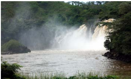
Cachoeiras do Binga Falls

Leaving Luanda early we travel down the coast road. We cross the Kwanza River and pass through Kissama Park. Travelling down the coast road we cross the Rio Longa river (forming the southern border of Kissama) and enter into Kwanza Sul province. We then take a coffee break in Porto Amboim, appreciating the spectacular scenery of Kwanza Sul, we take a small worthwhile diversion to visit the pretty waterfalls at “Cachoeiras do Binga” on the Keve River. We will then continue to Sumbe where we will have lunch (*alternatively we may have a picnic at the Fall depending on timings). We will then continue to Lobito where we will arrive late afternoon. We will check into our hotel and have a deserved dinner. See more info about the destination here - > https://web.facebook.com/rioiris.fazenda/photos?source_ref=pb_friends_tl