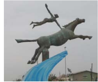
Statue Lobito (Canhão Bernardes)