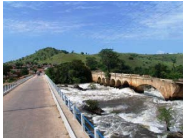
Spectacular Kwanza Sul landscapes (Keve River)