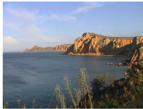
Views of the southern Beaches