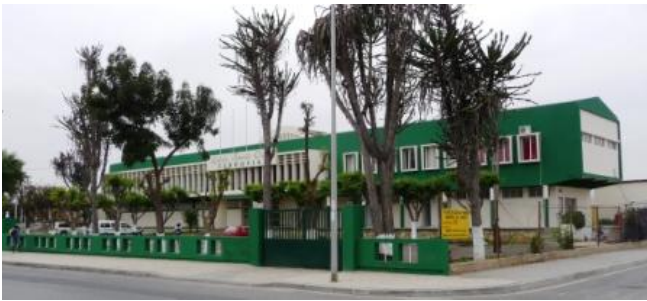
"Ferrovia - Lobito Sports Club"