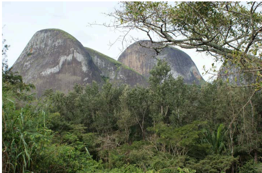
Rio Iris Farm and Kumbira Escarpment views