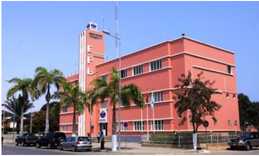
Art Deco - Benguela Radio Station

After breakfast, we will make a quick tour of Lobito and transfer through Catumbela to Benguela (renowned for its wide avenues and architecture). We will then move further south to the famous southern beaches of Baia Azul and Cahotinha where we will have a snack lunch. After lunch we will travel to the Kapembawe Lodge where we should have time for a quick safari trip. We will have dinner at the lodge.