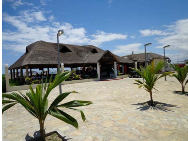
Porto Amboim – Bar Porto Amboim = Fish Lunch !