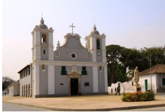
Our Lady of the Populo Church