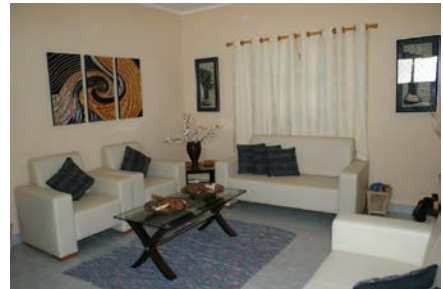
Rio Iris Farm